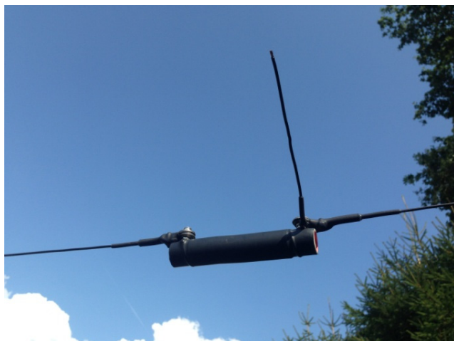
Figure 5: Piece of wire at the output of the 1st extension spool

If the resonance at 80m is not around 3.65MHz, the end of the antenna wire must be extended by a few cm (at > 3.7MHz) or shortened (at < 3.7MHz). I had to shorten the end of the antenna by almost 15cm.