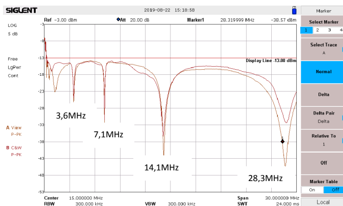
Figure 3: SWR of the strongly shortened KW wire antenna

The resonance curve (SWR) of the mounted antenna is shown in Figure 3. The purple curve shows the SWR without counterweight (original) and the yellow curve with a choke (current line insulator) at the input of the TRX.